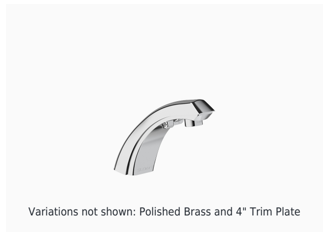
Variations not shown: Polished Brass and 4" Trim Plate